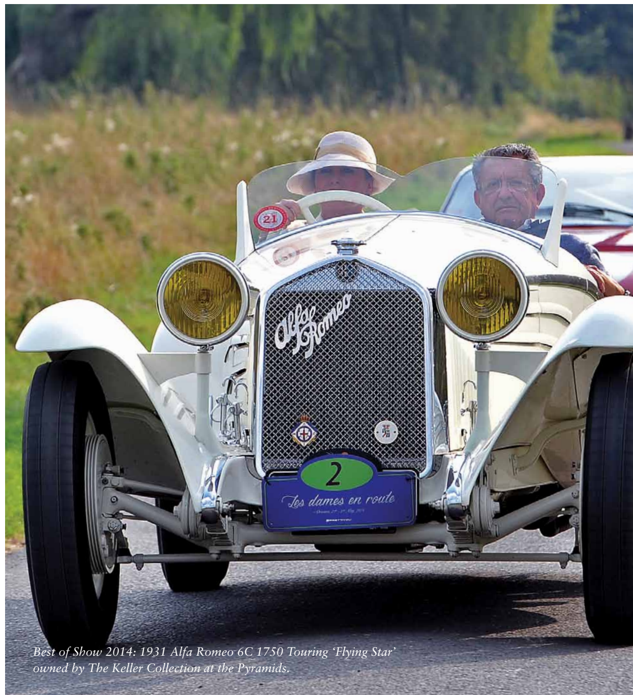
Best of Show 2014: 1931 Alfa Romeo 6C 1750 Touring 'Flying Star' owned by The Keller Collection at the Pyramids.