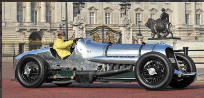
HRH Prince Michael of Kent GCVO, Patron of the Concours of Elegance, driving the mighty 1933 Napier-Railton 24 litre Special from Buckingham Palace to the 2013 Concours of Elegance at St James's.